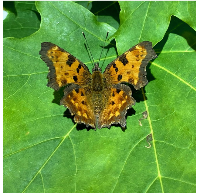
FIGURE 1 Polygonia c-album , female on maple leaf

The Comma butterfly P. c-album (Linné, 1758) (Figure 1) has a large distribution area, spanning from Great Britain and northern Africa in the west, to Japan in the east. It is a facultatively multivoltine species, having more than one generation per year in areas where the summer season is sufficiently long, and undergo diapause as imago. Uniform daylength, especially if shorter than 13 hr, favors the developmental path leading to diapause readiness, while increasingly longer days (e.g., L:D 12:12→22:2) experienced during larval development favors the path leading to directly reproducing adults,